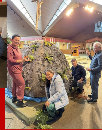
Christmas Setup in the Church