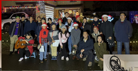
FAA Christmas Caroling